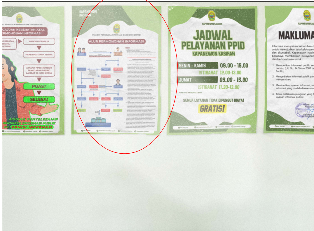
Poster Alur Pelayanan Informasi